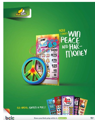
17 x 22 Poster