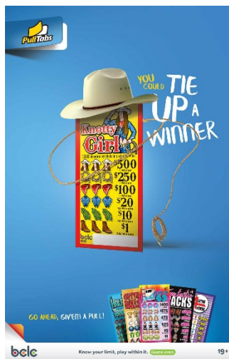
11 x 17 Poster