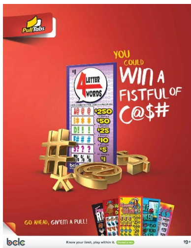
8.5 x 11 Poster