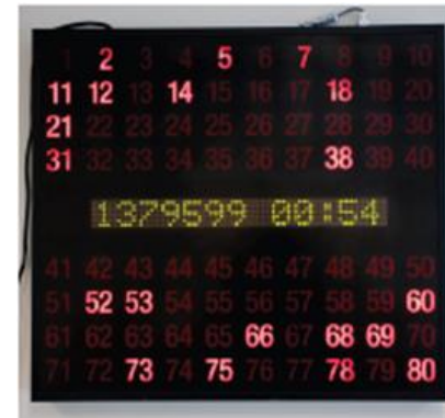
Keno Board & Keno TVs

*Digital Signage is not connected to the lottery terminal and remains constant. (Select locations)