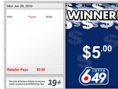
Player Display Unit